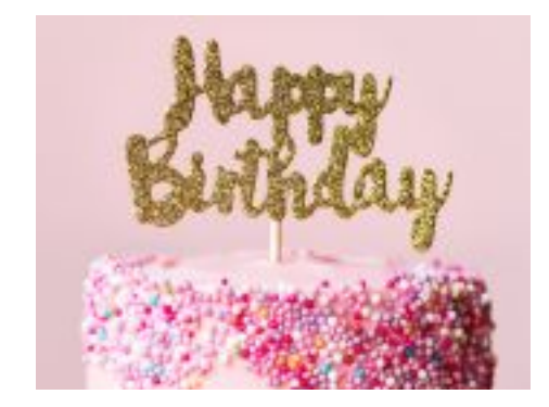
We are excited to celebrate this Month's Birthdays with cake and refreshment on April 25th at 2pm .